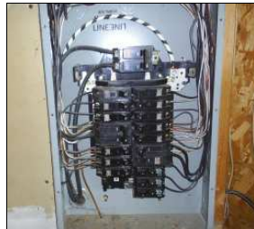
We open main electrical panels!